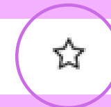
Nursing Assessment Tool

Please note you can back date the date and time in the Date taken and Time taken fields if required.